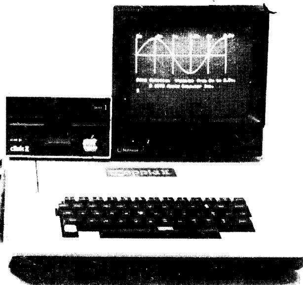
APPLE II COMPUTER.